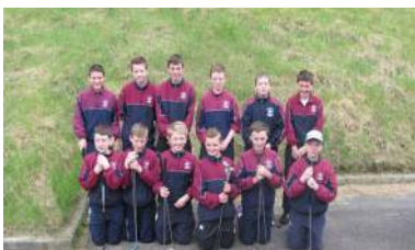
schools pitch and putt competition

The Cork County Board, in conjunction with the Pitch and Putt Union of Ireland, run a primary